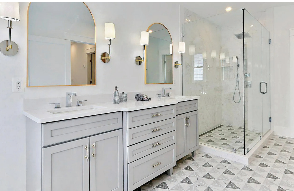
Eon Carrara 12x22 Glossy and Classico Carrara Peak 7x8 Hexagon