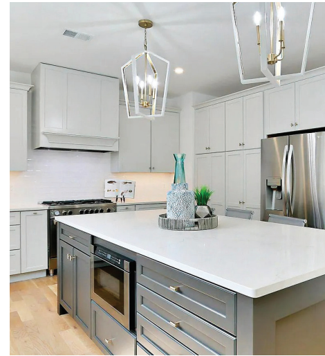
Flow Frost 3x12 Subway and Capital Lighting Maren 4-Light Pendants