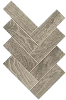
Herringbone Mosaic Available in all solid colors