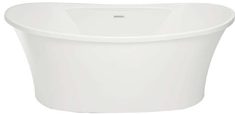
White Freestanding Tub $2,490.62 66" W x 36" D x 25" H HYSBRE6636ATO-WHI