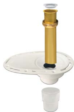
PVC Drain for Freestanding Tubs FLDRAINFC-T-PVC-18 $122.98

A fast and easy way to install a freestanding tub with less installation time. It is ideal for tight spaces with minimum access and allows easy access for repairs.