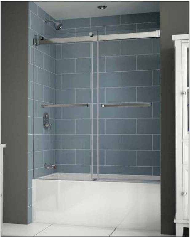
Gemini Plus Tub Door 10mm, Sekur+ Glass, 60" W x 66" H