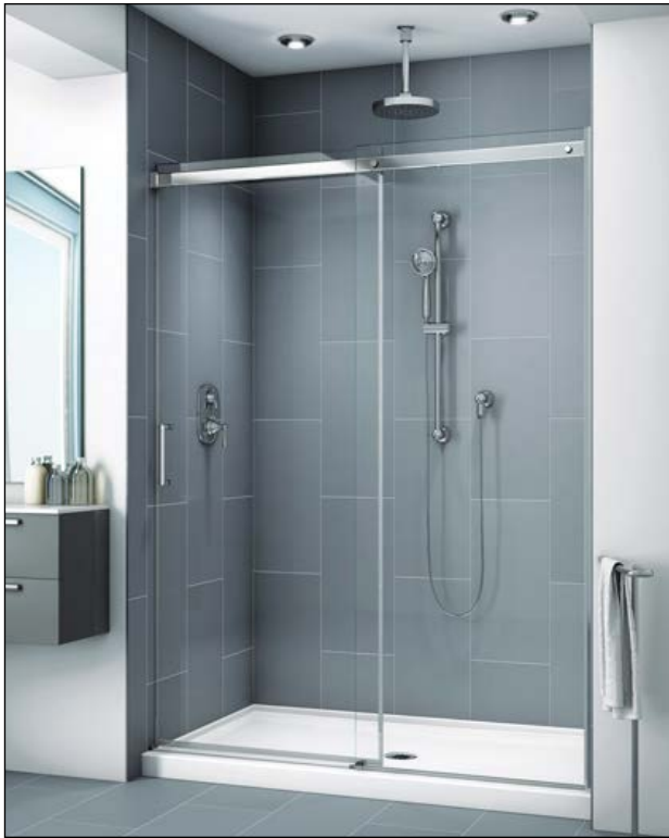
Apollo Inline Door with Fixed Panel 6mm, Sekur+ Glass, 57"-60" W x 75" H