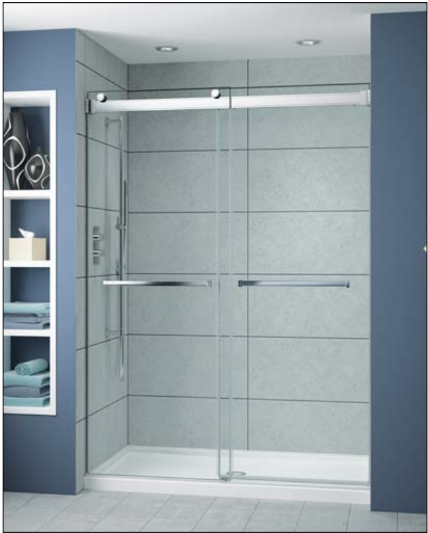
Gemini Plus Inline Door with Bypass 10mm, Sekur+ Glass, 60" W x 79" H

Brushed Nickel FLNAS60-25-40L (Left) $968.75