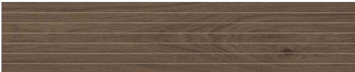
Spa Available in all colors