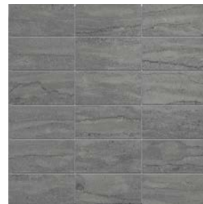
2x4 Stacked Mosaic